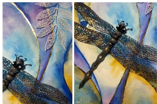
Figure 9. Design No. 5 implemented by the researcher.