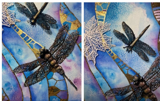
Figure 8. Design No. 4 implemented by the researcher.