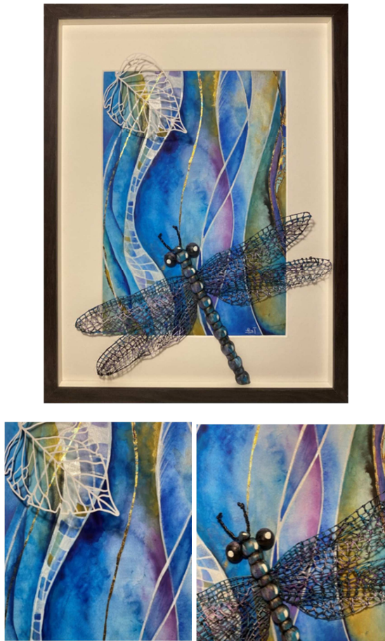
Figure 6. Design No. 2 implemented by the researcher.