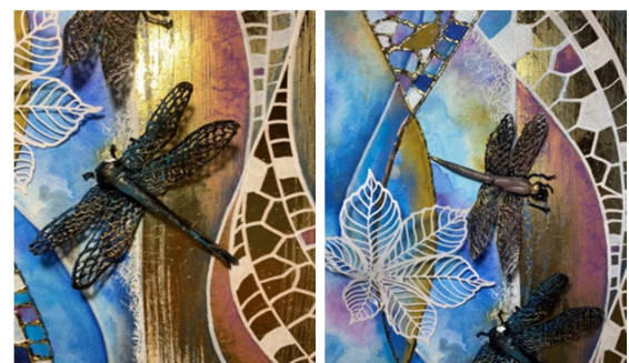
Figure 5. Design No. 1 implemented by the researcher.