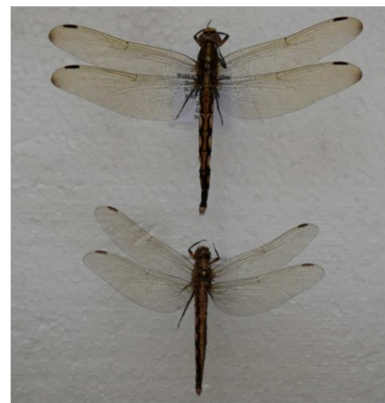
Figure 2. The dragonfly female The body seems more thick [7].

The dragonfly has a pair of spherical compound eyes that can distinguish colors sharply; In the forehead there are three eyes that can distinguish between light and dark and help in navigation during flying. In the dragonfly's forehead there are two short antennae, those antennae are tactile receptors. The mouthparts are on the underside of the head and include the mandibles for chewing. The dragonfly is one the biggest insect in terms of eye size comparing with the head size since the two eyes represent half of the head size, in front of each eye there are lenses. The super vision system distinguishes dragonfly, the full image for the dragonfly is forming from all images received from those small lenses. This is due to its' large eyes that extend till back of the head and enables it to