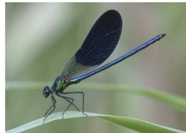
Figure 1. The dragonfly male The body seems thin [7].

Abdomen of the dragonfly female is more thick and has egg-laying appendage at the end of abdomen. (figures 1, 2)