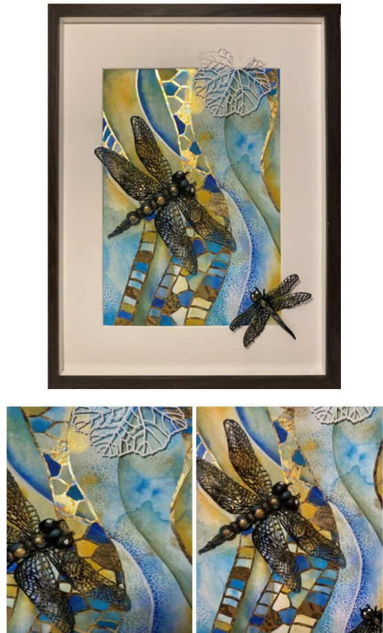
Figure 7. Design No. 3 implemented by the researcher.

structure of Veronoi scheme distinguishing the dragonfly wing.