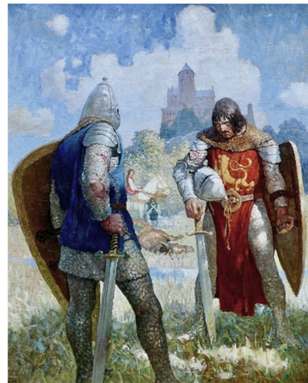
Figure 12. N. C. Wyeth, I am Sir Launcelot du Lake , King Ban's son of Benwick , and knight of the Round Table from The Boy's King Arthur by Thomas Malory, published in 1917.

The Pre-Raphaelites sought to compose aesthetically beautiful scenes that depict a particular moment in the stories they illustrated, whereas the Americans were out to tell a story with their images, to enhance the drama as they captured the reader's imagination and directed attention to key aspects of the fiction. Pyle presented realistic scenes of high drama and Wyeth painted in a psychologically tense manner, with a kind of other-worldly atmosphere, indicative of ancient legend. These tendencies are evident in Wyeth's I am Sir Launcelot du Lake , King Ban's son of Benwick , and knight of the Round Table , Figure 12. Wyeth's focuses on a tense lull in the action, as the two foes, Sir Launcelot and Sir Turquine face off and catch their breaths before renewing their sword battle which is destined to end in the death of one or the other.