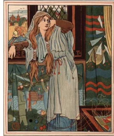
Figure 8. Howard Pyle, illustration for The Lady of Shalott , for Tennyson's The Lady of Shalott , Dodd Mead & Co., 1881.

We learn that suffering the curse, she leaves the tower in an effort to reach Camelot but dies in the journey.