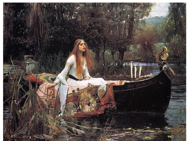
Figure 10. John William Waterhouse, The Lady of Shalott , 1888, Tate Museum, London, Presented by Sir Henry Tate 1894, N01543.