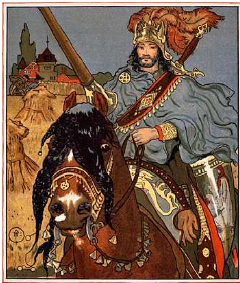
Figure 7. Howard Pyle, Lancelot , illustration for Tennyson's The Lady of Shalott , Dodd Mead & Co., 1881.

While the Pre-Raphaelites inspired the Americans, Pyle, in the stories he penned and illustrated, relied more on Twain's interpretations in his take on Arthurian adventures and less on Malory and Tennyson than did his British predecessors. However, his first foray into the tales was not as author, but as illustrator for the 1881 American release of Tennyson's poem "The Lady of Shalott." Pyle's colorful, bold images mimic qualities of illuminated manuscripts from the Middle Ages including historiated initials and calligraphic text. One of his full-page illustrations, Figure 7, features Lancelot as he is first seen by the Lady in the tower. Extending beyond the picture frame, the gallant knight and his well-adorned mount face the reader and the damsel, commanding respect. [14]