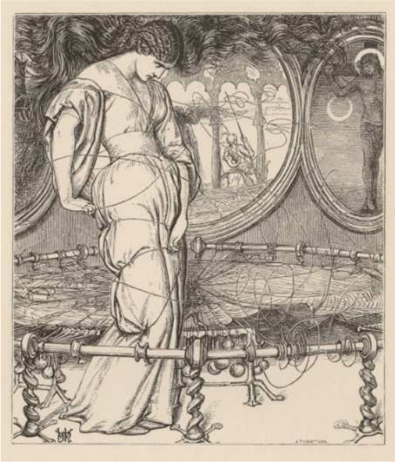
Figure 2. William Holman Hunt, The Lady of Shalott , 1857, Published in Alfred, Lord Tennyson, Poems (London: E. Moxon, 1857). Wood engraving on paper, 3 5/16 x 3 1/16 in. (9.5 x 8 cm.). Unsigned. Museum of Fine Arts, Boston J. H. and E. A. Payne Fund.