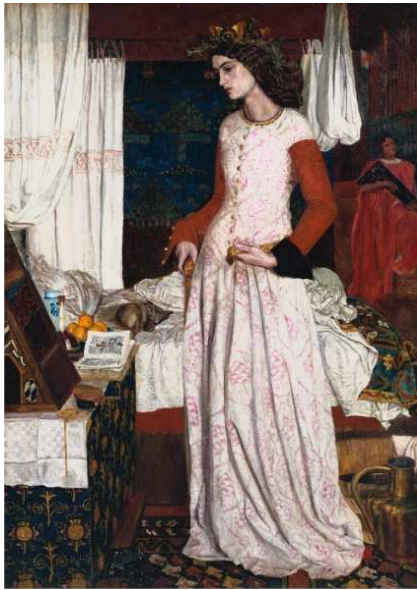
Figure 5. William Morris, La Belle Iseult, Queen Guinevere , 1858, Tate Museum, Bequeathed by Miss May Morris 1939, N04999.

by her own reflection in a table mirror, while fastening a girdle belt around her waist.