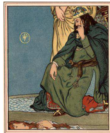
Figure 9. Howard Pyle, The Lady of Shalott , 1881, Illustration for Tennyson's poems, NYC, Dodd Mead & Co. Publisher.