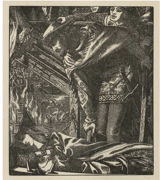
Figure 4. Dante Gabriel Rossetti, Sir Launcelot in the Queen's Chamber , 1857, Birmingham Museum Trusts, 1904 P404.

Rossetti's illustration of Tennyson's writing on Guinevere and Launcelot emphasizes sin and guilt [8]. Both saw Guinevere as a key figure, as an exemplar of beauty, whose passion and temptation drove the noble knight to betrayal. In Rossetti's 1857 illustration, Sir Launcelot in the Queen's Chamber , Figure 4, the illicit lovers take refuge in Guinevere's bedchamber while a group of knights congregate outside its wooden door.