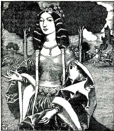
Figure 11. Howard Pyle, The Lady Guinevere , from The Story of Arthur and His Knights , 1903 (New York: Scribner).

Different from his colorful Lady of Shalott illustrations, many of Pyle's renderings were black and white pen and ink drawings. These carefully detailed artworks mimic woodcut prints again harkening back to medieval art [15]. The Lady Guinevere , Figure 11, a drawing for Pyle's 1903 novel entitled The Story of Arthur and His Knights , has the Queen delicately holding a rose and turned away from the jousting knights in the far background, as Launcelot fights to defend the honor of the Queen and seeks to gain her favors. Pyle presents her as a passive embodiment of beauty, not so much to underscore her subservient position, but perhaps to help the reader better understand the spell she holds over the love-struck Launcelot.