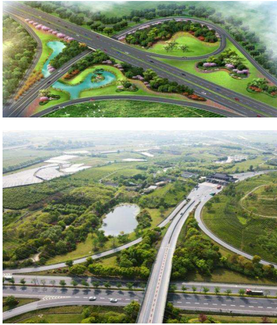
Figure 4. Landscape of Jingshan Entrance (self-painted and taken on site).