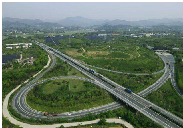
Figure 2. Jingshan Entrance of Hangzhou-Changxing Expressway (The picture is taken onsite.).