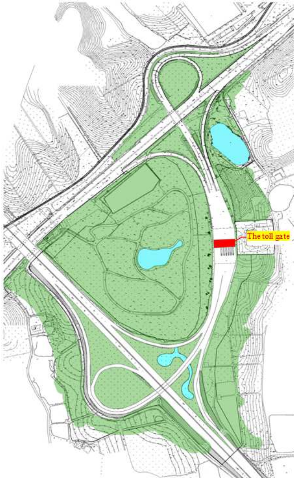
Figure 3. Design Scope Chart of Jingshan Entrance (self-painted).

tourism network characterized with “experiencing Zen Tea and its culture” will be established. By doing so, the artistic conception of Zen Tea, namely “the world’s Jingshan Mountain and the first town of Zen Tea” is created (See Figure 3 and Figure 4).