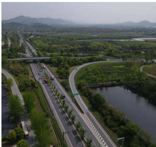
Figure 5. Real Shot from Aerial View.