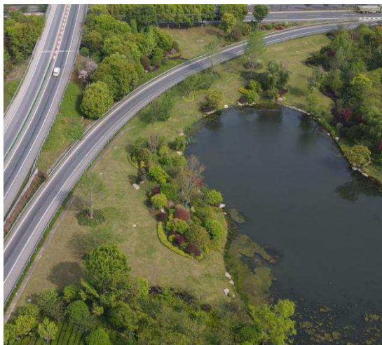
Figure 6. Real Shot of the Greenbelt at the Roadside.