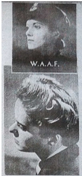
Figure 21. 'WAAF'.

The WAAF cap took over its basic design from that of the ATS. In the opinions from readers of The Woman , one reader said she liked her uniform but not the hat. 'I am in the WAAF and find the uniform itself comfortable. But why are our hats so unsuitable? If we had forage caps like the ATS, the whole uniform would seem smarter—Miss M.R. (Nottingham)'. [23]