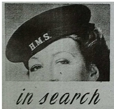
Figure 8. 'W.R.N.S.'.