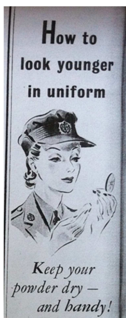
Figure 17. 'Air Spun'.

As mentioned above, khaki uniform and khaki colour were disliked by many women. However, there was suitable make-up for this khaki uniform. The explanation in an article says that 'khaki is a special problem', and 'needs a special make-up', and that khaki 'is apt to make you look sallow, so be sure to choose warm powders with rose overtones, and clear vermilion and flames for lipsticks'. [32] In an advertisement for 'Air Spun' powder, the woman having powder compact shows 'how to look younger in uniform'. (Figure 17) [33]