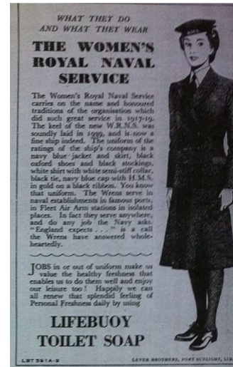
Figure 6. The WRENS (1939).

The WRNS uniform was the most popular of women's military uniforms. Figure 5 shows the uniform of the WRNS in 1918. The uniform for the Second World War changed in skirt length and hat shape. The length of the skirt's uniform was shortened, and the hat lost its brim and became smarter. The new WRNS uniform was seen in public for the first time at the National Service parade in Hyde Park in July 1939. One advertisement for the 'Lifebuoy Toilet Soap' in 1943 introduced the uniform for the Wrens [another abbreviation for Women's Royal Naval Service] (Figure 6).