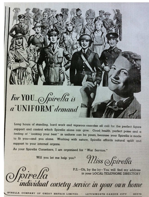
Figure 16. 'For you...Spirella is a "Uniform" demand'.

The next advertisement for Spirella appeared on 4 November 1939 (Figure 16). [30] The caption says again that 'Good health, perfect poise and a feeling of "looking your best" in uniform can be yours, because your Spirella is made to fit you---and you alone. Working with nature, Spirella affords natural uplift and support to your internal organs'. Women in military uniform entered here again. Besides ATS woman, WRNS woman, the WAAF, woman in the nurse