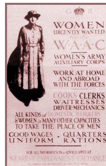
Figure 9. 'W.A.A.C. (1916)'.

The Women's Army Auxiliary Corps (WAAC) played an active role in the First World War. On 31 March 1917, WAAC women wore their khaki uniforms when they landed in France. Military-style khaki jackets were worn not only by officers but also by some drivers, with the long skirts. The ranks wore pudding basin felt hats, and the officers wore man-style peaked caps. Figure 9 is a WAAC recruiting poster at the end of 1916. [19] Women in this poster put pudding basin felt hats on their heads. Figure 10 is the uniform for WAAC in 1917. The uniform was made of 'khaki wool gabardine suit with a beige silk shirt' and it was supplied by George B. Ashford Ltd of Birmingham, and the label "Woodrow, Piccadilly, London" was stuck on the khaki felt hat. [20] The WAAC was renamed the Queen Mary's Army Auxiliary Corps in May 1918, which ended up until 1919. The WAAC uniform was succeeded by that of the Army Auxiliary Corps (ATS), which was established in September 1938.