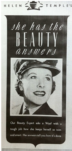
Figure 20. 'She has the beauty answers'.

that 'all told, more make-up is used in, than out of the WAAF'. [5] A wartime observer, Peggy Scott, considered this enhanced concern for appearance in the services 'a different femininity': 'It is not merely to attract men but because they think more of themselves. Doing men's work and being treated as mates by the men has given the girls a better sense of their own value'. [45]