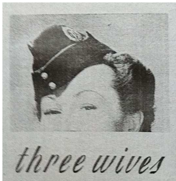
Figure 13. 'A.T.S.'.

fit for this hat. The article says that 'This smart little cap is so small and neat itself that it demands a neat head to go with it'. [15] It continues to say that 'the perfect hair style to wear with your forage cap is a roll, curled up smoothly and firmly all round your head'. As seen in Figure 12, the neat hair style was recommended. After they enrolled in the service, two hats were given to them. 'Pat has two new hats. The trim peaked cap for duty-wear, and the perky walking-out cap which she is wearing in the photograph [Figure 13]'. [14] As women who wore hats appeared in the cover page in The Woman on 16 January 1943 (Figure 14), their hats attracted much attention. [25]