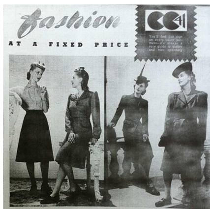
Figure 1. 'Fashion: CC41'.

As the Second World War continued, restrictions on clothing for civilian women increased. The restriction called 'CC41', for example, was one of the most distinguished during the war. 'CC' of 'CC41' is the abbreviation for the Clothing Controls and '41' was added to it because these controls began in 1941. As the caption in Figure 1 says, this restricted clothing was also called 'utility garment', which was recommended as 'always a sure guide to quality and wise spending' for civilian women. [6]