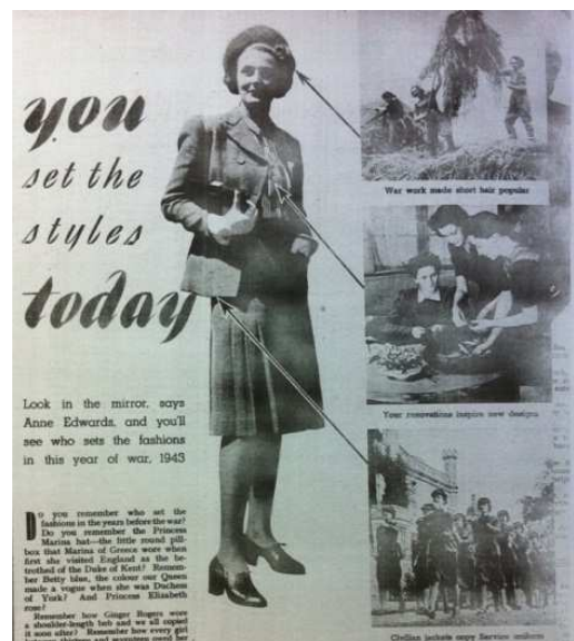
Figure 2. 'You set the Styles Today'.

As the caption that 'Twins in navy wool as smart for the Wren [Women's Royal Naval Service] as it is warm for her brother' in the article 'H.M.S. [His Majesty's Service] WAISTCOAT!' shows in Figure 3, this waistcoat was based on the WRNS [Women's Royal Naval Service] uniform. [8] In this way, some civilian clothing imitated the military uniform, and some parts of the military uniforms turned into those of civilian clothes.