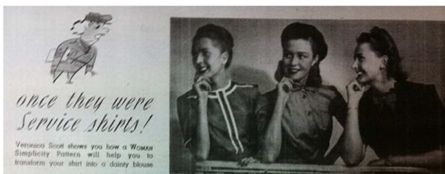
Figure 24. Once They were Service Shirts!

After the Second World War ended, articles about the military uniform in magazines almost disappeared. [48] However, the military costume during the war affected the style of clothing even after the war. One article, "Once They were service Shirts!" says that 'Veronica Scott shows you how a Woman Simplicity Pattern will transform your shirt into a dainty blouse'. Here women wear 'dainty blouses' which were transformed from 'service shirts'. Now women put on civilian clothes inspired by the military uniform and are projected as fashionable images (Figure 24). [49]