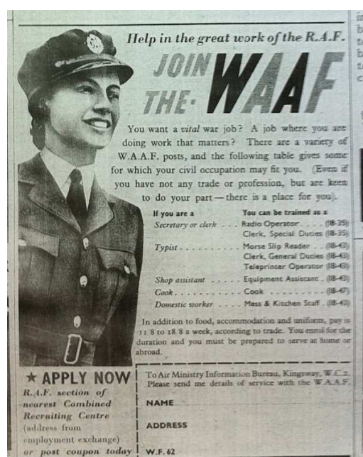
Figure 19. 'Join the WAAF'.

An advertisement to recruit the WAAF was inserted in The Woman on 22 February 1941 (Figure 19). [40] There the woman wore the uniform that was inspired by that of the ATS, and also by that of the RAF airman's service. The WAAF uniform was based on the design of the RAF uniform. It was called 'the Royal Air Force blue uniform'. The colour called 'air force blue' was considered as characteristic of the WAAF. The jacket consisted of pleated breast pockets, large tunic skirt pockets and integral waist belt. [13]