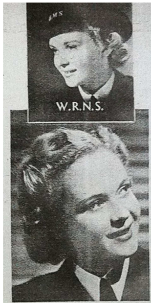
Figure 7. 'H.M.S.'.

nylons have replaced the stockings and a pair of smart black court shoes has been added to the quota of uniform'. [12]