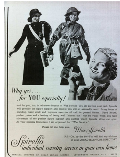
Figure 15. 'Why yes... for You especially!'.

Spirella Corsetiere was a company that has specialised in made-to-measure corsets since it was established in 1904 at Oxford Circus, London. Two women in military uniform can be seen in the advertisement. The woman on the left side is from the ATS. The badge 'AT' is attached on her uniform. The woman on the right side is perhaps from the Auxiliary Fire Service (ATS).