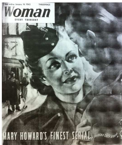
Figure 14. 'A.T.F. Woman in Cover Page'.

As soon as the military uniform was established, many advertisements for the promotion of using laundry and encouragement of selling weekly newspaper and commodities such as cocoa and toothpaste began to appear. ATS women in uniform who 'show frequently their splendid work', were utilised for these various advertisements. [26, 27, 28]