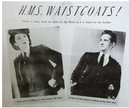
Figure 3. 'H.M.S. Waistcoat!'.

In the article, 'Smart exchanges', Anne Edwards shows her readers again that 'a service and a civilian girl could give each other tips on appearance' (Figure 4). [9] During the War, service and civilian girls gave each other hints and drew inspirations mutually. This partly means that military uniforms were very similar to civilian clothes and that military uniform was an icon of admiration for the civilian girls.