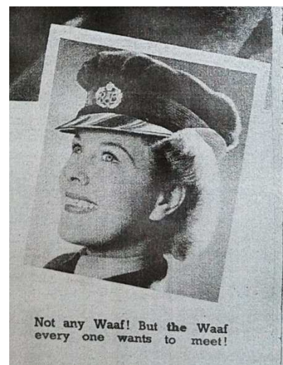
Figure 23. 'Not any Waaf!'.

The woman in the left side photograph above (Figure 22), first, shows a glum expression on her face and is described as 'one of a crowd, pretty but anonymous. Just any Waaf!' Then, in the next large photograph, she ties up her hair to fit the hat using new pins without cut hair. As a result, as the caption