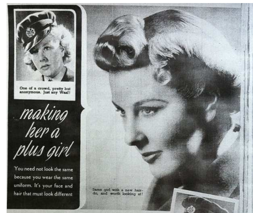
Figure 22. 'Making her a Plus Girl'.

Women of the WAAF changed their hairstyle according to the cap. As an advertisement says, 'The WAAF cap with its soft pouched top does allow you to keep curls on top if you like, but the hair beneath your cap must be sleek and tidy' (Figure 21). [44] A woman of the WAAF mentioned that after she served in the military affair, she changed her hair. 'I found the best style for me was to roll my hair round a ribbon, into a halo... but some girls find this doesn't suit them so they curl their hair in curlers every night and wear a net on parade (which they soon take off!)'. As the WAAF had a camp hairdresser, the member went to her parlour 'Helen Temple's Beauty Parlour' once a week on Mondays. The caption says that 'A free cut and shampoo are now given to every Waaf... and set it obtainable for 6d extra'. [42]