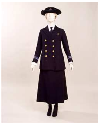
Figure 5. Uniform of the WRNS (1918).