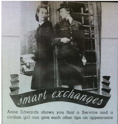
Figure 4. 'Smart Exchange'.

In the article, 'Smart exchanges', Anne Edwards shows her readers again that 'a service and a civilian girl could give each other tips on appearance' (Figure 4). [9] During the War, service and civilian girls gave each other hints and drew inspirations mutually. This partly means that military uniforms were very similar to civilian clothes and that military uniform was an icon of admiration for the civilian girls.