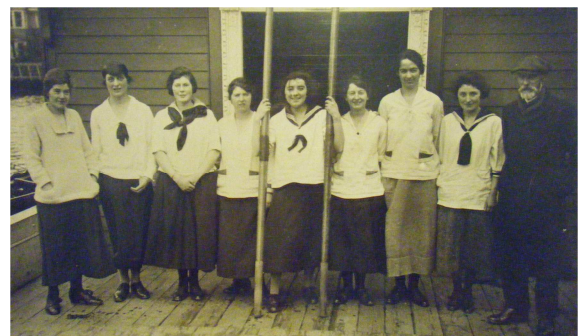
Figure 9. Rowing (St. Hilda's, 23, October, 1919).

Royal Holloway is located near River Thames and Butbridge reminisced, 'For most of us the great attraction was boating on the Thames at Egham... The clothes included ancient corsets, that were probably Victorian!' [23] As the years progressed, in the 1920s college girls began to wear new clothing for sports, but interestingly, Victorian corsets were still a part of the outfits. Just like hats and gloves were, corsets were also a part of conventional Victorian feminine dress and even in the 1920s women were probably not considered respectable if they were not wearing corsets. [24]