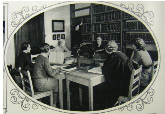
Figure 13. Illustrated London News (1937).

In an article that was published in the Illustrated London News on 6 th November 1937, a student was seen wearing an academic robe during a lecture (Figure 13). In the same article, some college girls were seen wearing academic gowns in rooms, the picture gallery and the library.