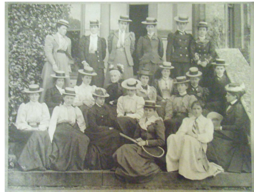
Figure 4. 1899 St. Hilda's College.

Into the 1890s, college girls began to wear a combination of skirts, blouses, hats, and ties. This clothing can be seen in the photographs of sports teams. Figure 4 is a photograph of the members of St Hilda's college in 1899. One of the members is holding a tennis racket. Figure 5, shows a dark blue tie with thin yellow stripes and white stripes that was worn by Miss Burrows around 1900. Miss Borrow was the first principal of St. Hilda's and, as a university archivist said, ‘the epitome of this ladylike approach.’ [16] Figure 6 shows a dark blue tie with broad pale blue stripes and a thin white strap. This was first used for hockey and later as a college tie.