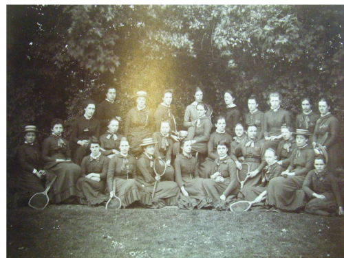
Figure 1. Tennis Team, 1885, Newnham College.