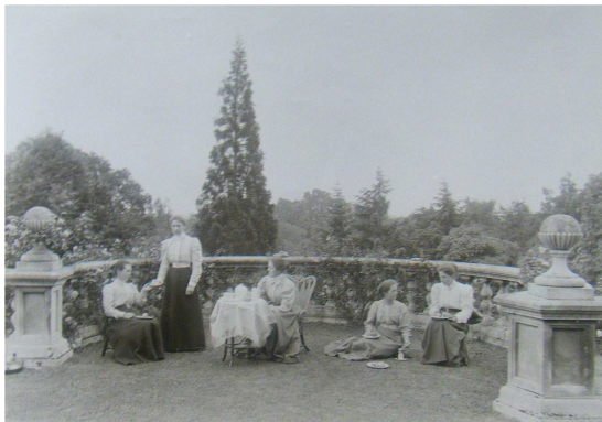
Figure 10. Tea Party, Royal Holloway College (1890s.).

held in the afternoon. Figure 10 is a photograph of a tea party at Royal Holloway around the 1890s. Cocoa parties were considered fashionable in those days. The hostess would serve cocoa and the richest cakes available.