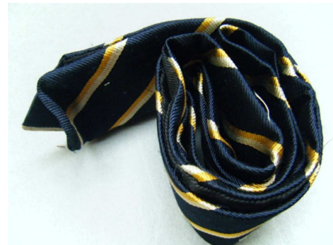
Figure 5. St. Hilda's College Tie.