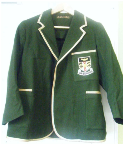
Figure 7. Tennis Jacket (1910s-1930s).

Figure 7 is a picture of the jacket worn by the students of Royal Holloway from the 1910s to the 1930s. This jacket was mainly worn while playing hockey, lacrosse and viewing boat races. Figure 8 which was published on 17 th of January in 1922 in The Sphere , shows that college girls at Bedford College wore this jacket.