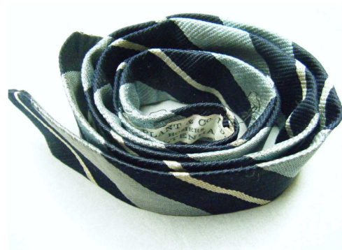
Figure 6. St. Hilda's College Tie.

The clothing for college girls reflects the environment of this period. It was not a uniform but a combination of skirts and blouses that was in style and was worn by women in general. Clothes for girls were required to be ‘simple and sombre’ and colleges ensured that this is practiced. [17] This