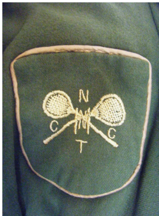
Figure 3. NTC, Initials.

It can be seen from a surviving costume of the tennis dress in 1885 (Figure 2) that the girls wore the bustle style dress which was considered fashionable in the 1880s and that the long jacket had (four) pleated layers. Figure 3 shows the breast pocket had the shape of a tennis racket and NTC embroidered on it, which were the initials of the Newnham Tennis Club. A student who attended the tennis match between Oxford and Cambridge on the 3 rd of July, 1886, said that this was ‘the prettiest costume.’ [14] Attending such inter-collegiate matches by wearing the same clothing considerably strengthened their sense of belonging to their own team or college. [15]