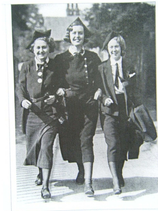
Figure 17. Mary Crampton Pym.

Barbara Mary Crampton Pym can be seen in the middle of the photo in Figure 17. She started studying at the college in 1931 and became a famous writer after graduating. [56] At St. Hilda's she was known as a fashion icon. Her friend on her right is holding her gown in her left hand. She has the same gown as the one that her seniors of Figure 16 wore ten years ago. The clothes of Pym and her friend to her right look very fashionable as they are wearing a jacket with buttons, a blouse with ribbons, and have curled hair and a cap.