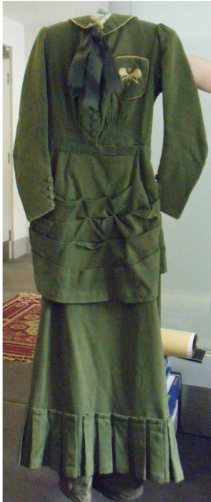
Figure 2. Tennis Dress (1885).

In those days, college girls were only permitted to play tennis as a sport. This was largely because femininity could be maintained while playing tennis and it could be played in ordinary clothing. Figure 1 is a collective photograph of tennis players in Newnham College in 1885.