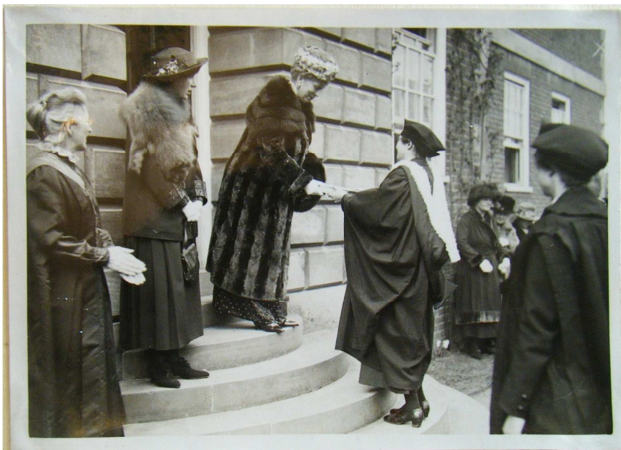
Figure 14. Ceremony, Lady Margaret Hall (1928).

Colourful gowns and hoods were seen at the tea party held after the ceremony. 'Over one thousand, I believe, and gowns and hoods of every gorgeous colour and M.A.s [masters of arts] and B.A.s [bachelors of arts] and undergraduate gowns too, of those just going down.' [48]