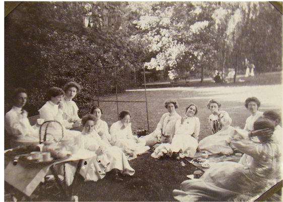
Figure 11. Garden Tea Party (1902-3).

In addition to the cocoa and tea parties, college girls enjoyed garden parties on fine days. Figure 11 shows a garden tea party held in Girton in 1902 or 1903. College girls can be seen wearing white blouses and skirts that were considered fashionable at that time.